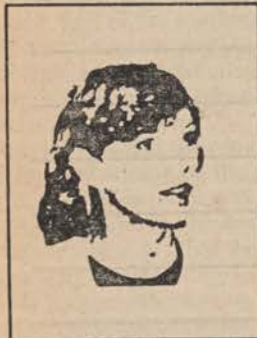
◀ Sample Photograph

Color films of the integral type, non-peel-apart, are unacceptable. These are easily recognized as the back of the films are black. The acceptable instant color film has a white backing.